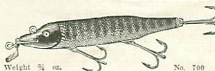
Weight 3/4 oz. Length 4 1/2 in. No. 700 Price $1.00

The greatest of all lures—for salt water or fresh! Recognized everywhere as the most deadly killer of all game fish! Even the large old educated Fish can't tell it from a live minnow! And how it gets 'em is nobody's business! Also made in "Silver Flash" finish No. 718!